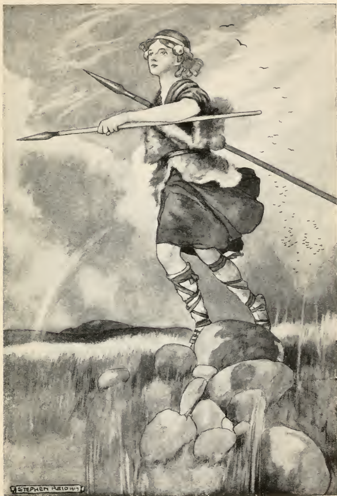
Cuchulain sets out for Emain Macha