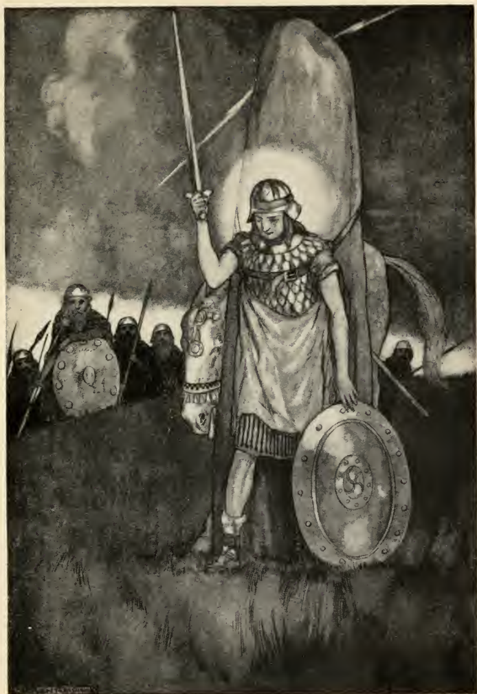
Cuchulain comes at last to his Death