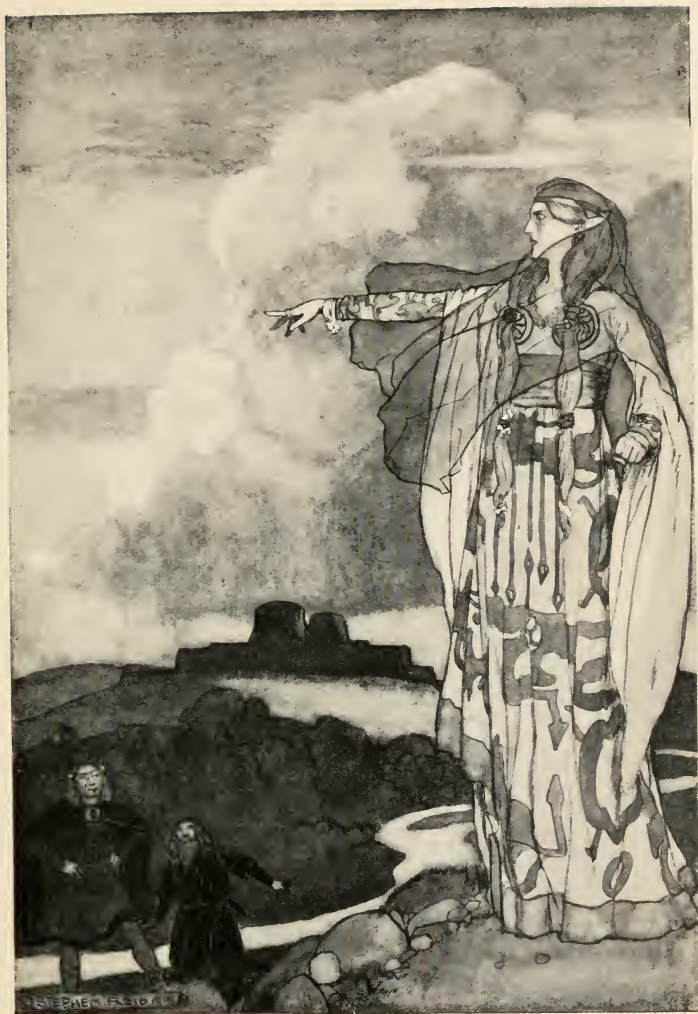
Macha curses the Men of Ulster