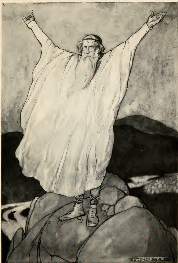
“ The moment of good-luck is come ”