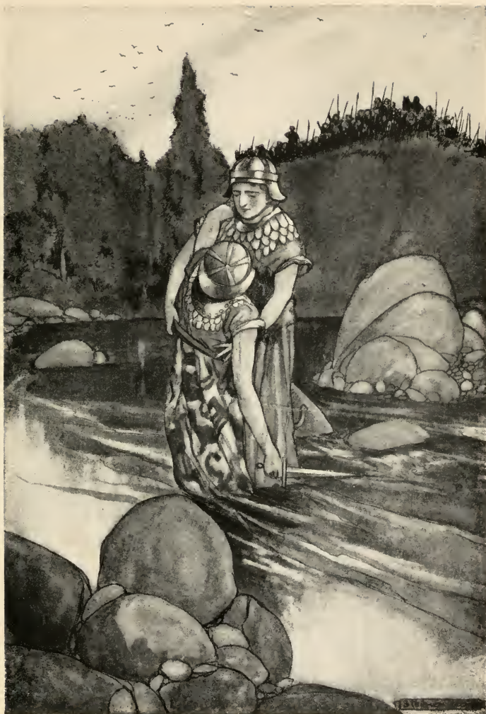
Ferdia falls by the Hand of Cuchulain