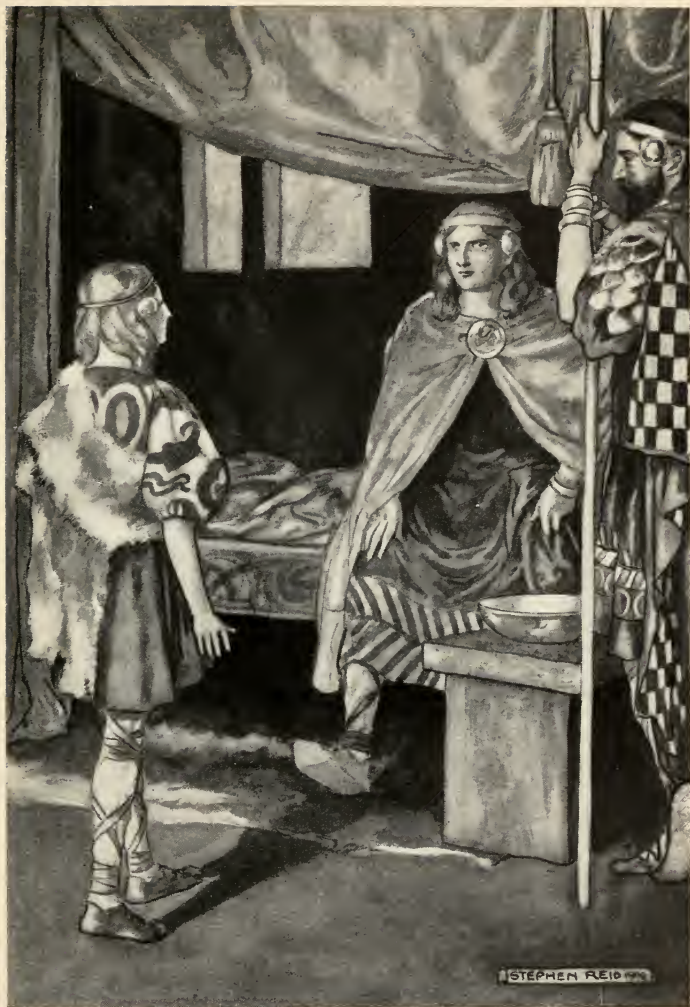
Cuchulain desires Arms of the King