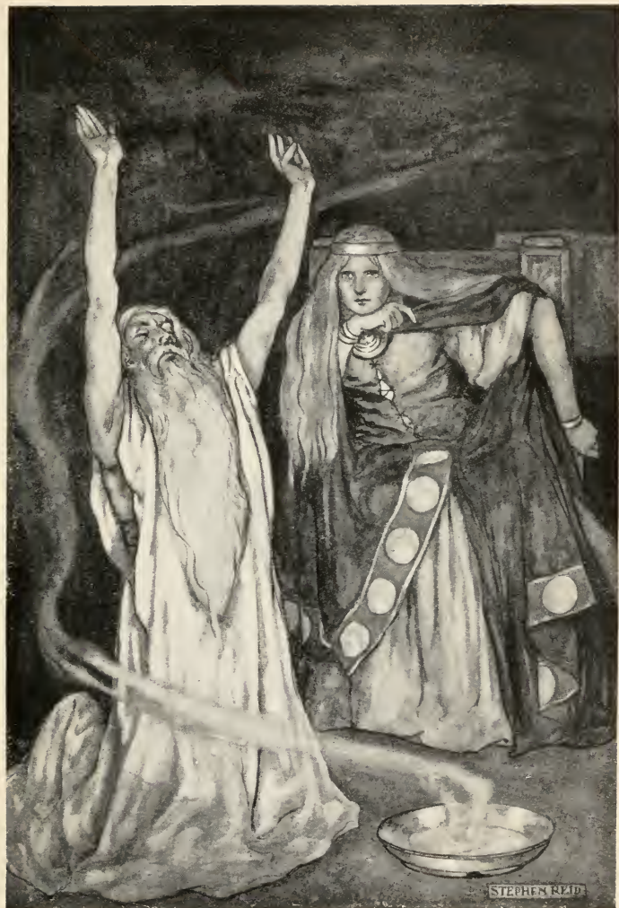
Queen Meave and the Druid